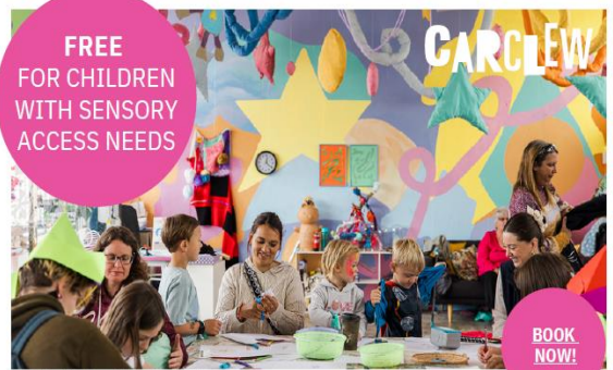
Image: Young Pom Pom artists

Talk to your teacher if you have any questions about your child doing the tests. For more information on NAPLAN, visit nap.edu.au .